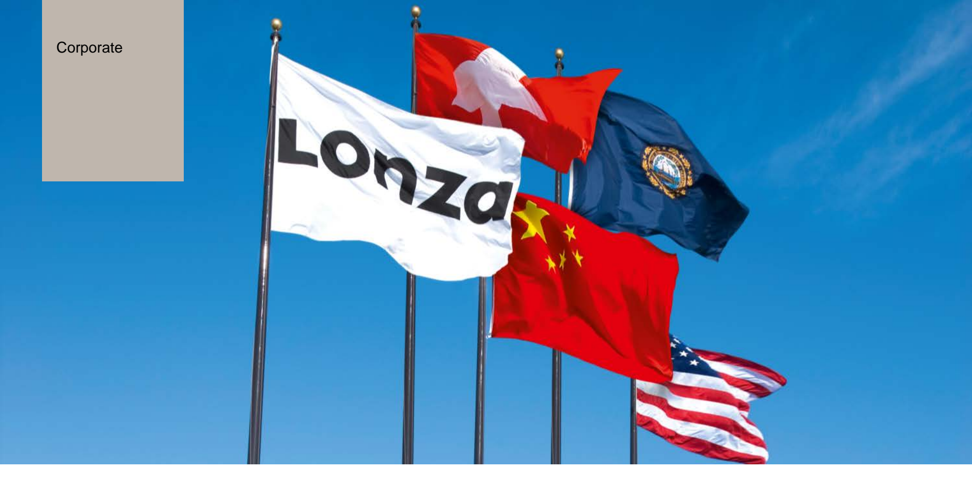
Science and Technology for Pharma & Biotech, Nutrition and Well-being